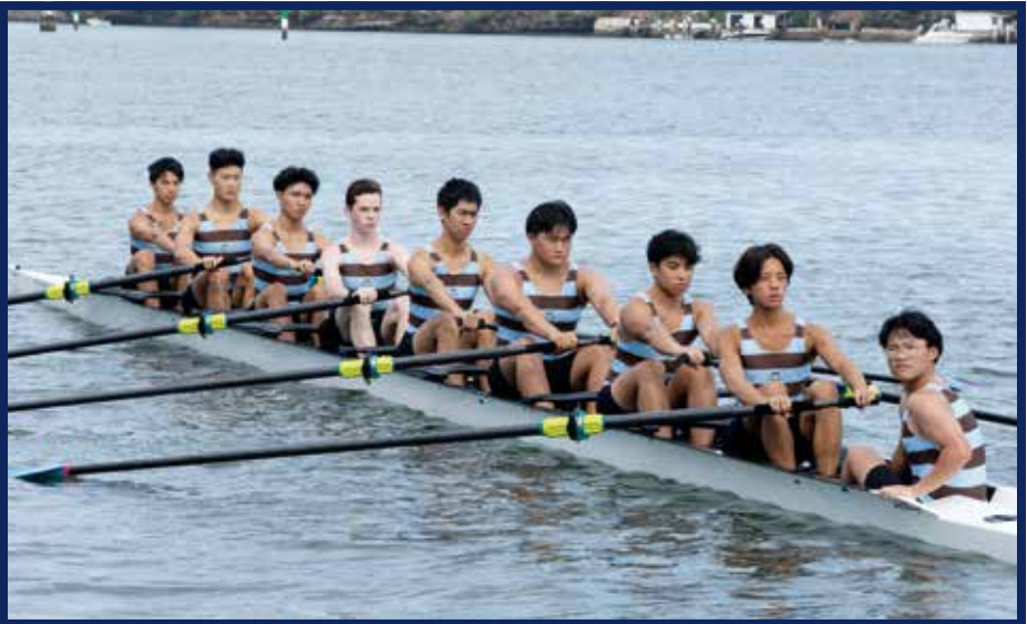
Sydney Boys High School