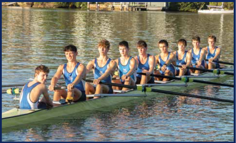
Saint Ignatius' College